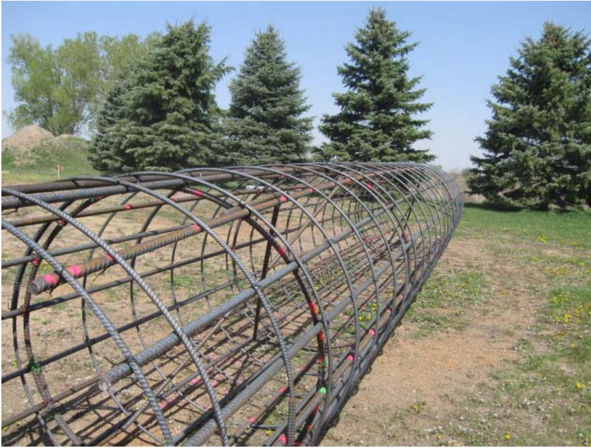
rebar frame for concrete

In late April, construction began for a new cell tower in the commercial development located at E. 60th St. N. and I-29. The finished product will be a 100' monopole. This series of photos depict the work which is done to prepare the footing needed to support the cell tower.