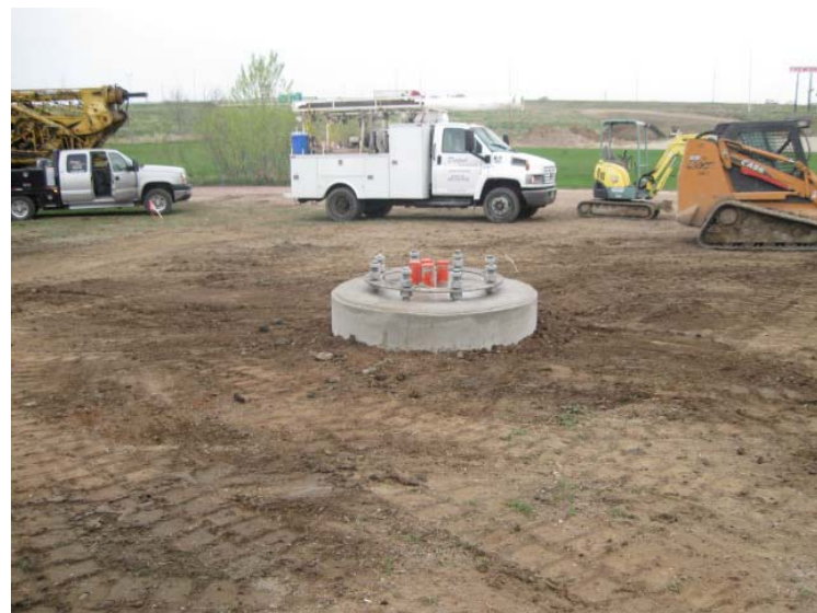
the completed footing

The final step is the placement of the tower anchor bolts.