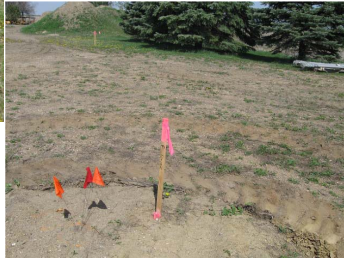
the selected site