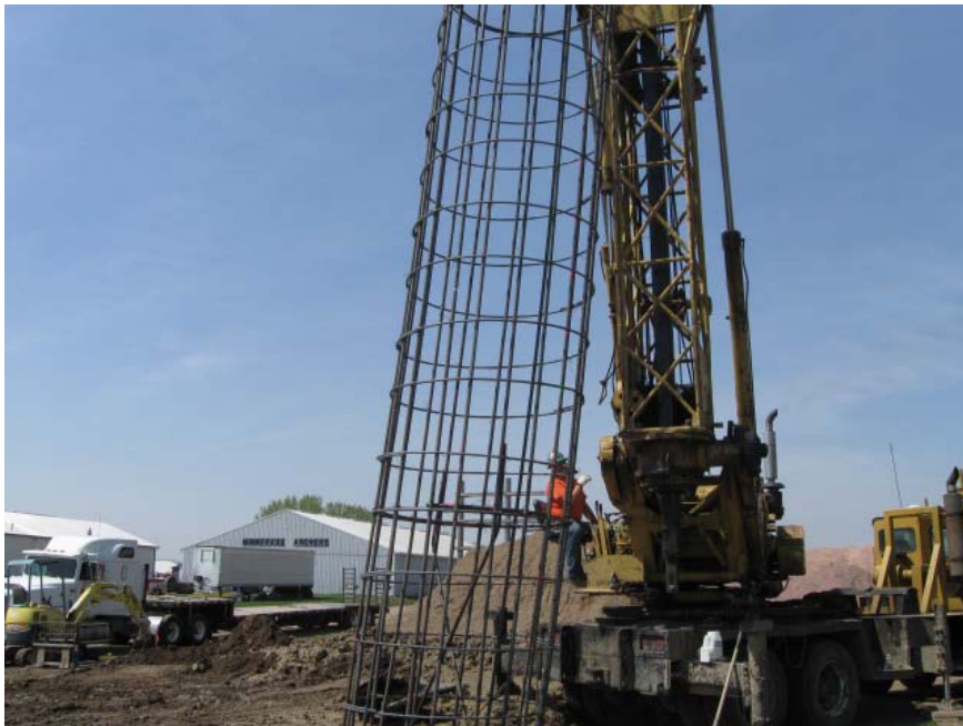
placement of the rebar frame